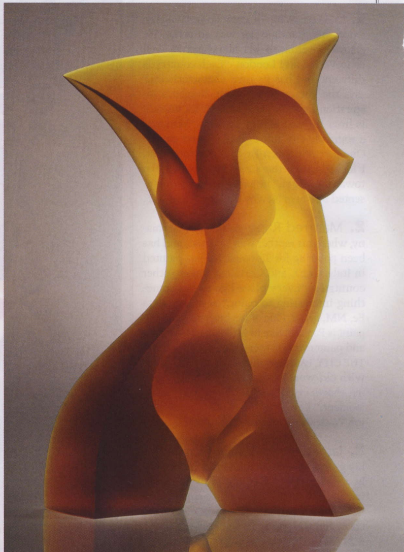
▲ TORSO VI, GLASS, 36 X 25 X 5.

Once he has his final drawing, he renders it in clay. On a small table in his studio, he